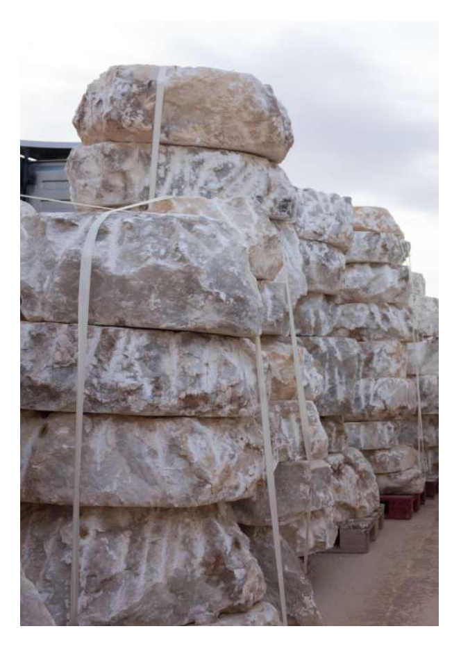
We supply alabaster in slices as it is one of the preferred formats for the further elaboration of products.